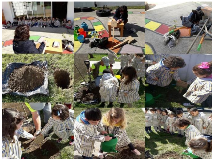
Figure 7. Kids and Garden improvement

The objective of this activity was to plant autochthonous species from the Portuguese forest in the kindergarten garden to enhance respect, protection and conservation of our autochthonous forest. This activity was made in collaboration with experts. Some species were selected such as: Quercus robur , Quercus pyrenaica , Acer pseudoplatanus , Prunus lusitanica ssp and Arbutus unedo . The soil was previously prepared and children with teacher guidance planted the previously mentioned species (Fig 7). Wooden plaques with the scientific names were placed next to each plant. The children showed clear pleasure during this activity.