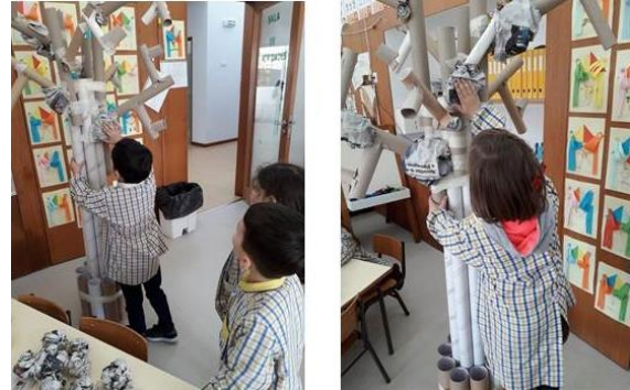
Figure 2A. Construction of the flag.

Subsequently children were asked to create a flag with recyclable materials (Fig 2A). Figures 2B and 2C illustrated the ultimate logo and flag.