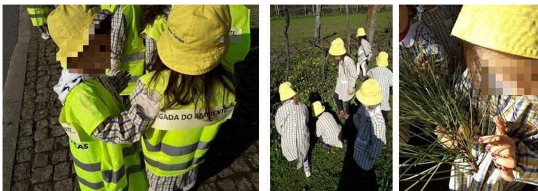
Figure 3A Cleaning brigade working in the forest