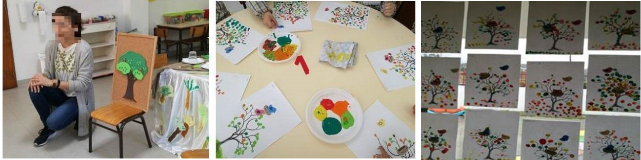
Figure 4A. Lecture” What to do to protect the forest and prevent fires”