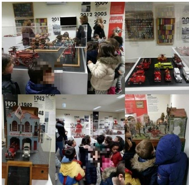
Figure 5B. Visit to Firemen's Museum

When children arrived to the kindergarten constructed objects using recyclable and natural materials alluding to this visit (fig 5C).