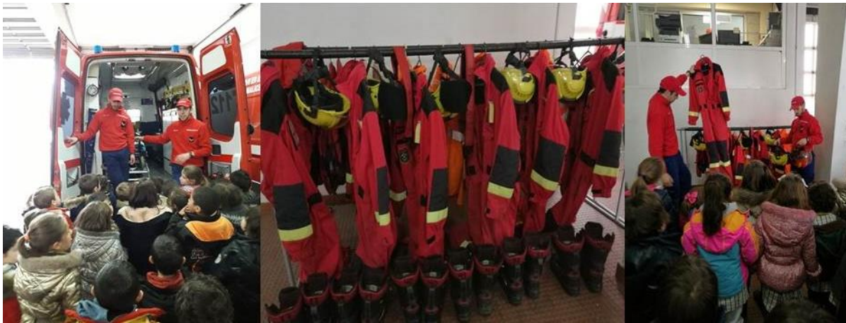
Figure 5A. Visit to the Headquarters of V.N. Famalicão