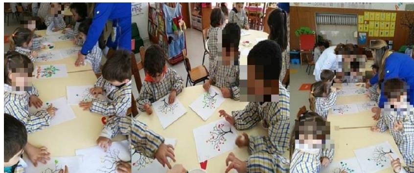
Figure 4B. Practical work: Trees design