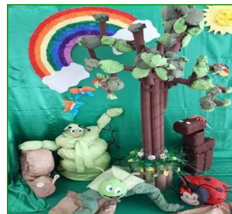
Figure 2C. Final Flag