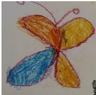
Figure 2B. Final Logo

Subsequently children were asked to create a flag with recyclable materials (Fig 2A). Figures 2B and 2C illustrated the ultimate logo and flag.