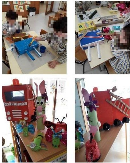
Figure 5C. Object creation using recyclable material alluding to the firemen's visit