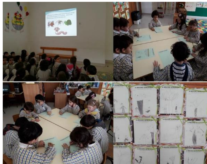
Figure 8B. Mini-Lecture: "Natural and Social importance of the forest and solidarity in the face of fires"