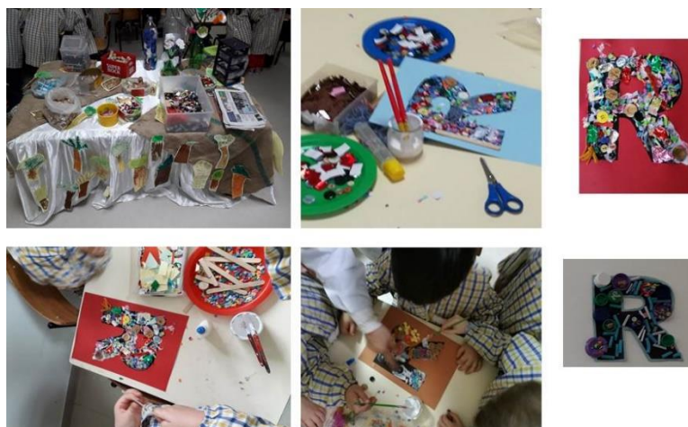
Figure 6. Recycling workshop promoted by the Scientific Team from the University of Minho

This activity was invigorated by a group of researchers from Minho University, located at Braga, Portugal. It initiated with a small interactive lecture adapted to children's age. The objective of this activity was to explore some contents such as 3Rs policy: To Reduce, To Reuse and To Recycle. Several examples of recyclable materials were presented. Afterwards, 3 sheets were distributed to the children with the Rs drawn. Children decorated the Rs distributed with recyclable materials, namely colored paper pieces, small pieces of straw, scraps of fabric, buttons, paper, caps, newspaper clippings, traces of fabric and plastic (Fig 6). In this activity, creativity was also explored.