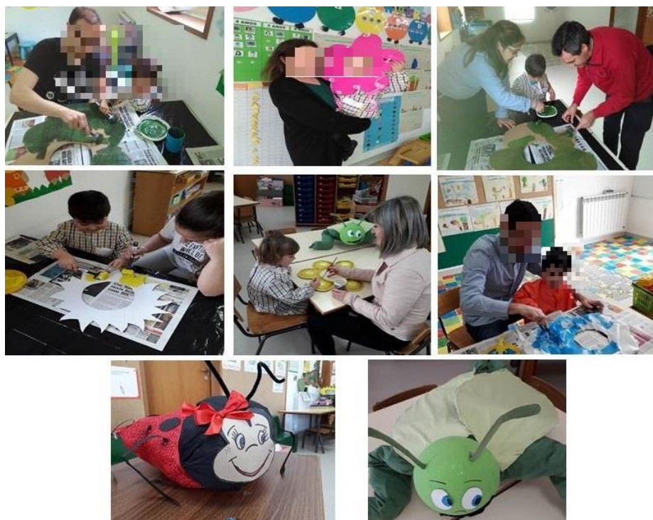
Figure 9. Clothes design alluding to the forest