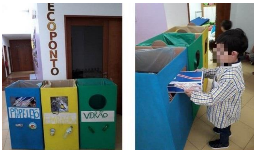
Figure 3B. Recyclable campaign: Ecopoints construction