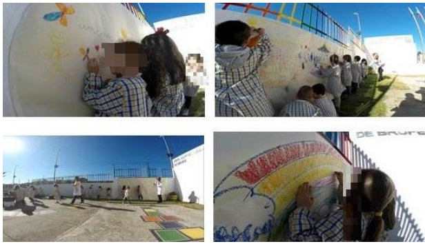
Figure 1A. Execution of a great mural in the school garden